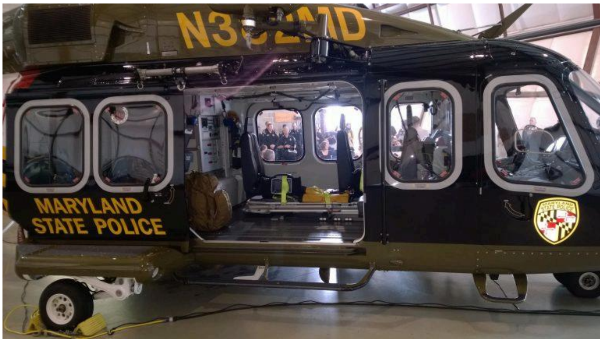
Maryland State Trooper Seven is based at St. Mary's Airport.