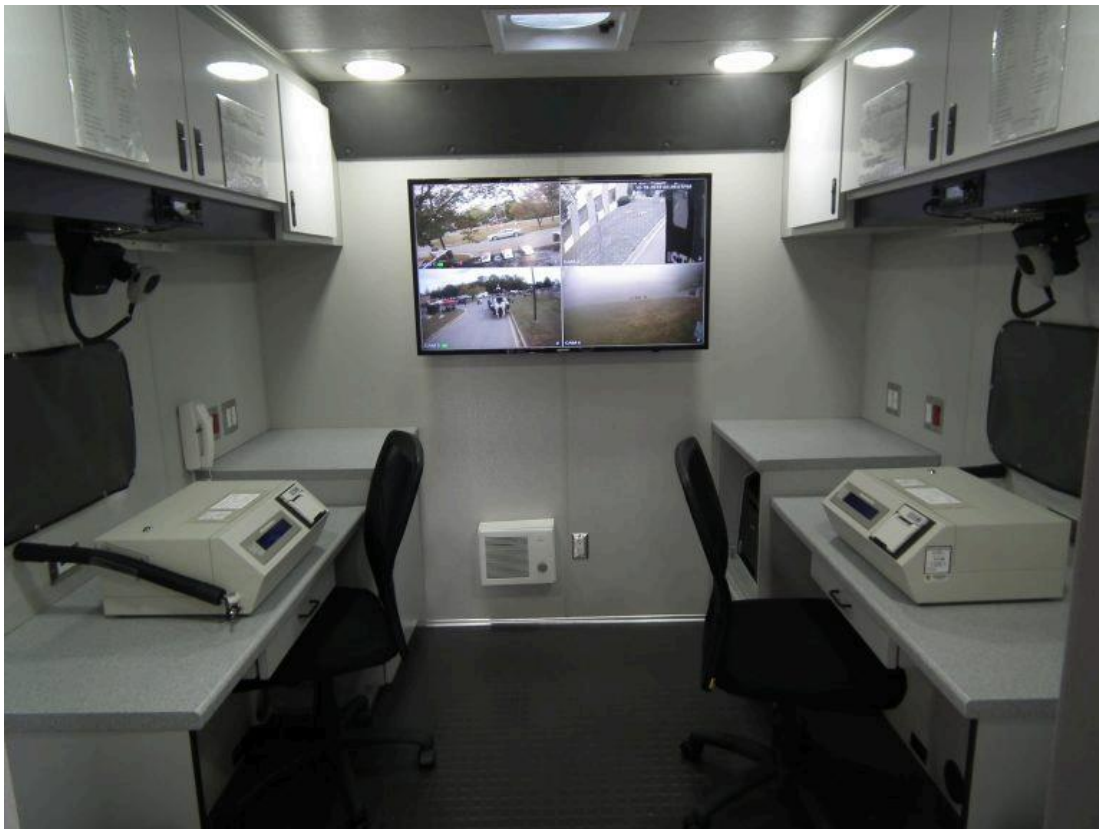
The Maryland State Police mobile breath analysis van for Sobriety Checkpoints. Motorists who fail this test in this van go straight to jail.